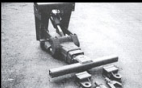
Fomula III T

Lift Capacity 6,000 lbs. with standard "L" arms 10,000 lbs. extended with lift forks 12,000 lbs. retracted with lift forks Tow Capacity 50,000 lbs. Extended Distance from Tailboard to C.L. of Fork 85" Power Unit comes standard with hydraulic valve and hand held remote control. Unit does not include necessary hydraulic fittings or hoses to connect to existing hydraulic system. Optional hydraulic kit for installation on mechanical wrecker is available. Tilt Optional independent power or Auto-Tilt