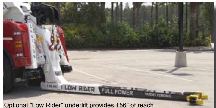
Optional "Low Rider" underlift provides 156" of reach.